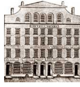
The Joy Building from "Early Illustrations and Views of American Architecture" by Edmund V. Gillon, Jr.

Historical Overview Evaluating the Storefront Deciding a Course of Action Rehabilitating Metal Storefronts Rehabilitating Wooden Storefronts Rehabilitating Masonry Storefronts Designing Replacement Storefronts Other Considerations Summary and References Reading List