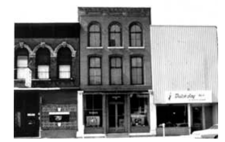
This photograph shows the impact of preserving

Where an architecturally or historically significant storefront no longer exists or is too deteriorated to save, a new front should be designed which is compatible with the size, scale, color, material, and character of the building. Such a design should be undertaken based on a thorough understanding of the building's architecture and, where appropriate, the surrounding streetscape. For example, just because upper floor windows are arched is not sufficient justification for designing arched openings for the new storefront. The new design should "read" as a storefront; filling in the space with brick or similar solid material is inappropriate for historic