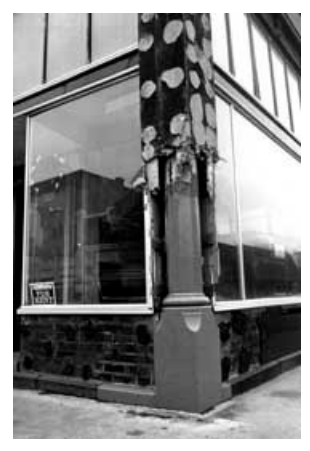
Storefronts of the 1940s, 50s, and 60s were frequently installed by attaching studs or a metal grid over an early front and applying new covering materals. Photo:

The important key to a successful rehabilitation of a historic commercial building is planning and selecting treatments that are sensitive to the architectural character of the storefront.