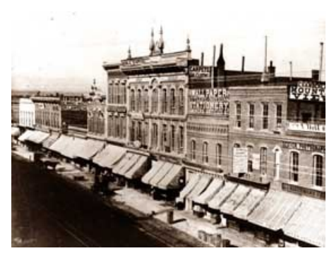
Try to locate old photographs or prints to determine what alterations have been made to the storefront

Where based on historic precedent, consider the use of canvas awnings on historic storefronts. Awnings can help shelter passersby, reduce glare, and