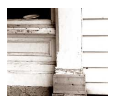
Rather than replace an entire wooden storefront, a new wooden component can be pieced-in, as seen in this column base.