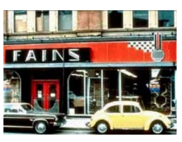
This 1930s Moderne storefront has gained significance over time and should be preserved.

A bewildering number of proprietary products also appeared during this period, many of which went into storefronts including Aklo, Vitrolux, Vitrolite, and Extrudalite. Highly colored and heavily patterned marble was a popular material for the more expensive storefronts of this period. Many experiments were made with recessed entries, floating display islands, and curved glass. The utilization of neon lighting further transformed store signs into elaborate flashing and blinking creations. During this period design elements were simplified and streamlined; transom and signboard were often combined. Signs utilized typefaces for the period, including such stylized lettering as "Broadway," "Fino" and "Monogram." Larger buildings of this period, such as department stores, sometimes had fixed metal canopies, with lighting and signs as an integral component of the fascia.