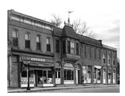
By evaluating the components of a storefront as well as their existing condition, a successful rehabilitation is more likely.