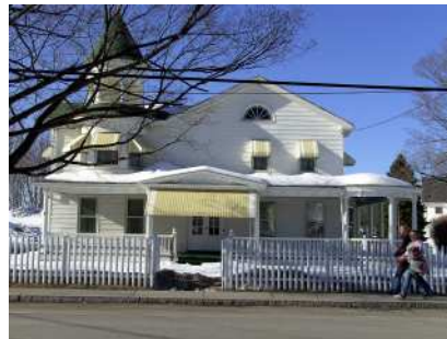
Existing use of picket fence in target area / residential