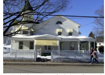
Existing use of picket fence in target area / residential