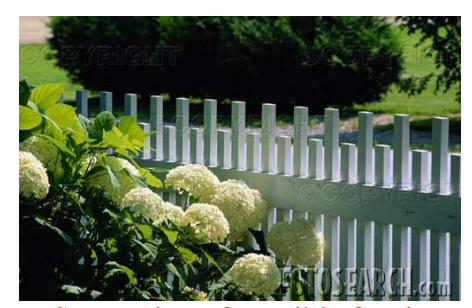
Suggestion of possible fencing style

1. Low 2 1/2ft wood white picket fencing to delineate Residential use on the Main St. set back 2ft