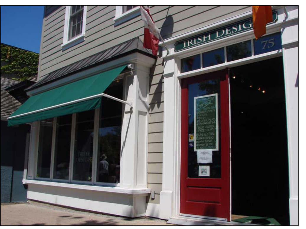
This traditional storefront uses a decorative door with signage above, to clearly identify the entranceway. Flags, a bay window with an awning, and decorative light fixtures project from the façade to add visual interest.