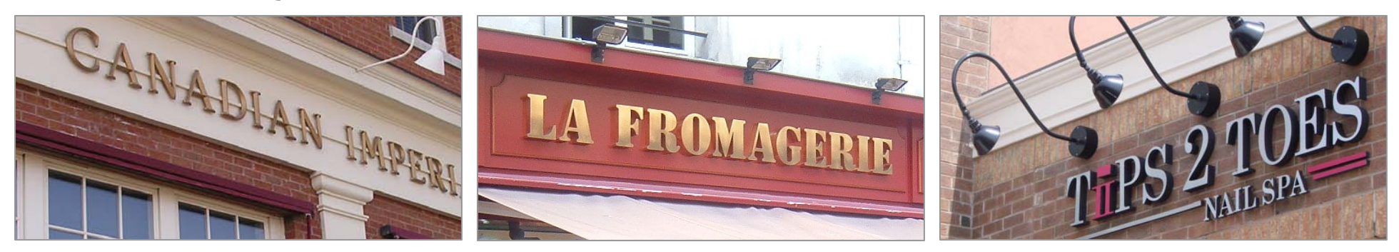
Externally Illuminated Fascia Signs