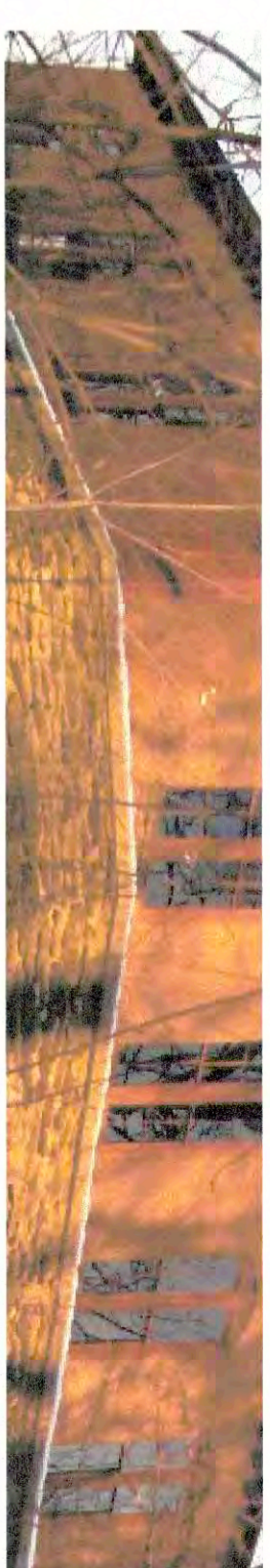
Vision without action is a daydream